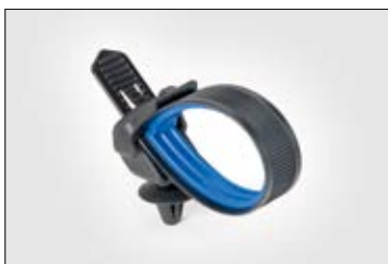
With arrowhead, with disc, for round holes