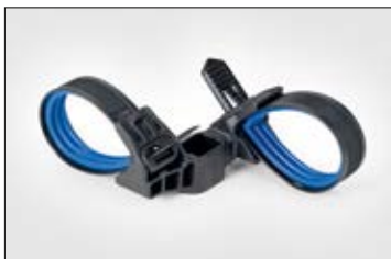
For weld studs, for parallel routing

All dimensions in mm. Subject to technical changes.