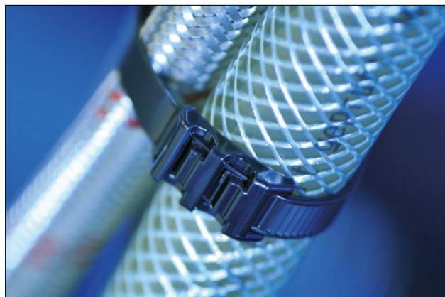
Low profile head cable tie, Robusto-Series.

In addition, the material has a high impact resistance to low temperatures which enables Robusto ties to be used in areas where it is cold, for example at high altitudes or Nordic countries.